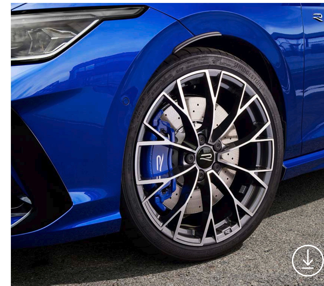
The newly designed 19-inch Warmenau wheel.