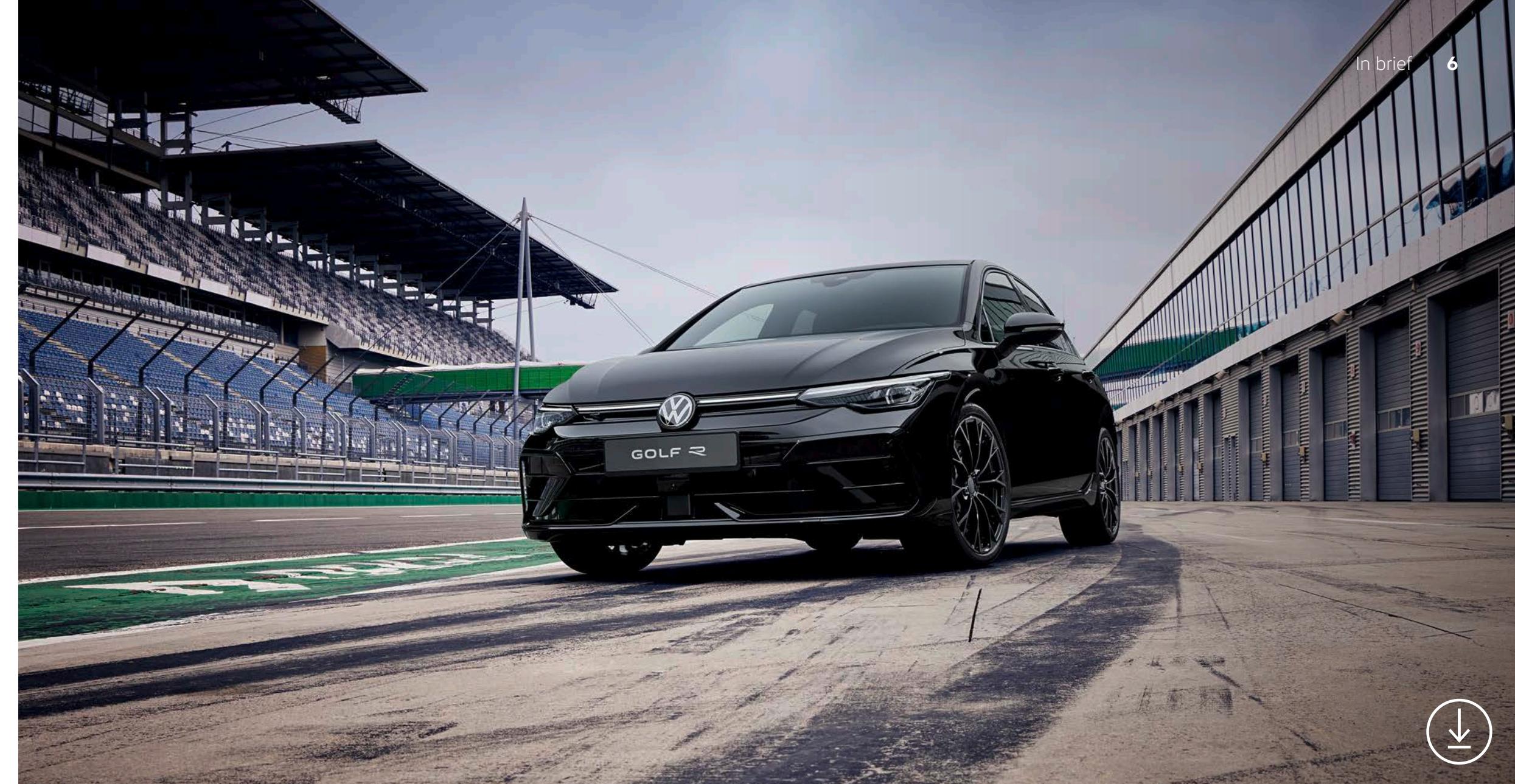
The Golf R Black Edition with Performance Package has a top speed of 270 km/h.

The debut of the new R models is another highlight in the long success story of the Golf R. It began in the summer of 2002 with the legendary Golf R32 5 (177 kW/241 PS) – this car and its four successors have sold far more than 250,000 units so far. The 4MOTION all-wheel drive system and maximum performance are common denominators and can naturally also be found in the 2024 Golf R models. This is particularly evident in the example of the new Golf R Black Edition – an exclusive model that will be available to order straight away upon market launch. The Golf R Black Edition is designed to have a completely dark look and has a top speed of 270 km/h 2 . It boasts features such as black 19-inch Estoril wheels (19-inch Warmenau forged wheel in black available as optional equipment),