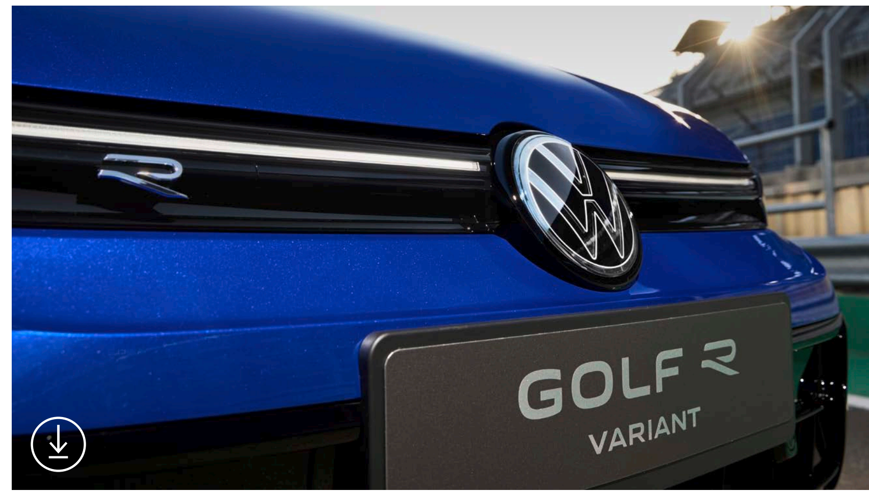
The Golf R with illuminated VW logo.