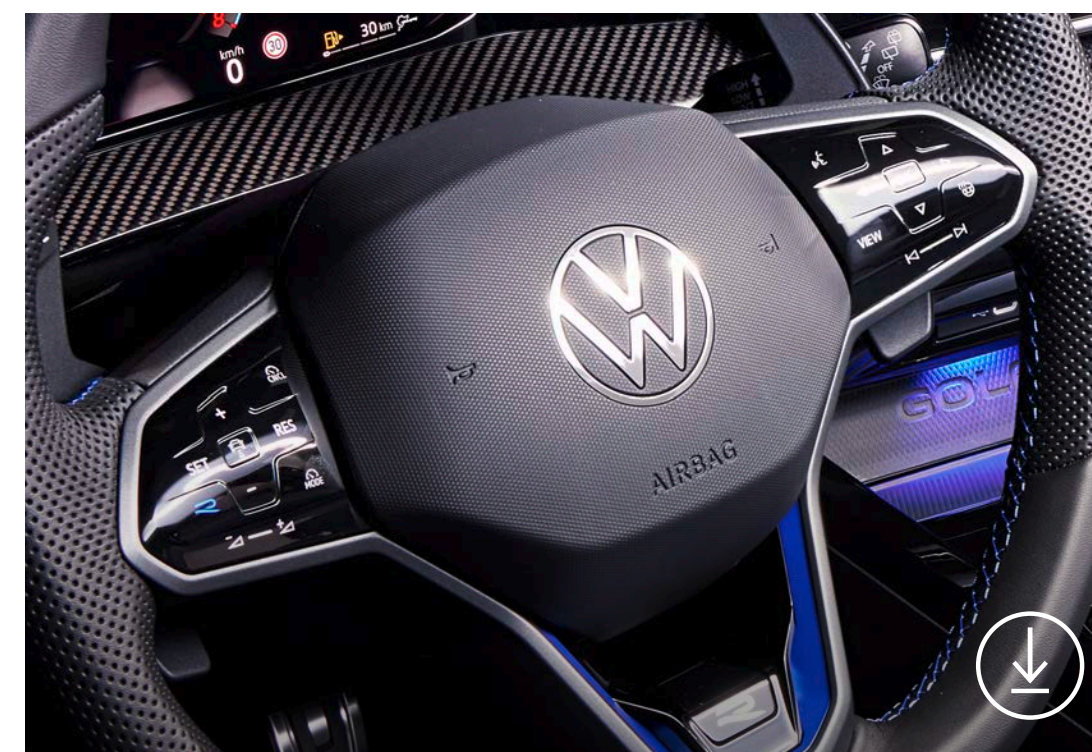
The new multi-function steering wheel with R button.

which activates the various driving profiles including the exclusive Race mode. To prevent unintentional activation of Race mode, the trigger threshold of the R button has been increased. Adjusting the speed when the Adaptive Cruise Control (ACC) is active is now also more intuitive: the plus button (+) on the steering wheel increases the speed by 10 km/h each time it is pressed, while the minus button (-) reduces the speed by 10 km/h. The SET button can be used to increase the speed in 1 km/h increments,