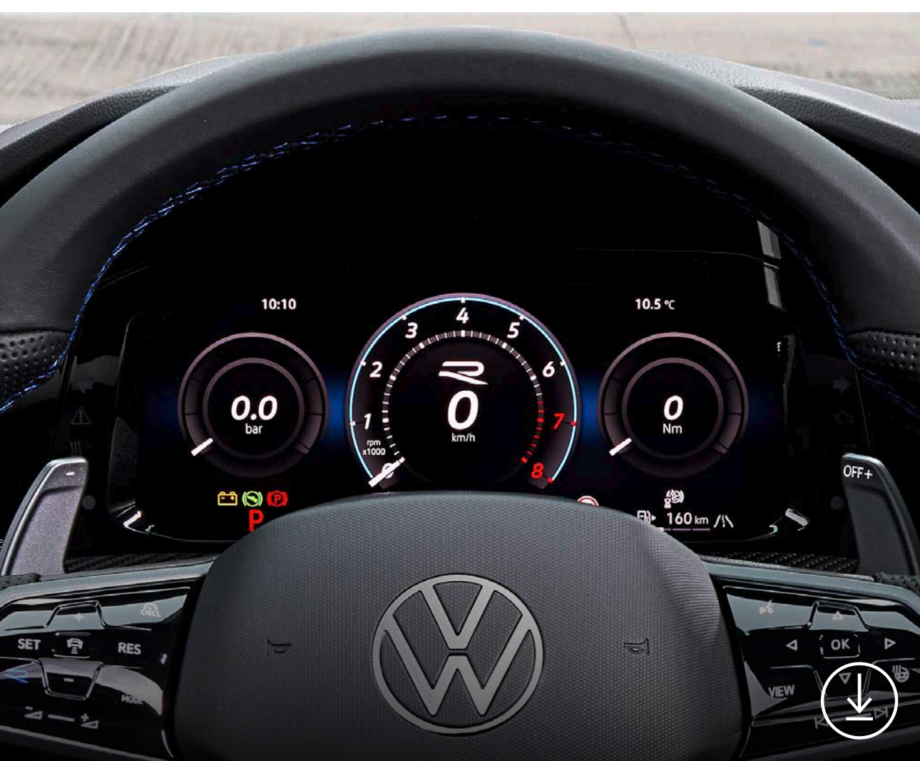
The new GPS lap timer of the Golf R.

darkened Volkswagen badges and R logos, black R brake calipers with a dark R logo and black tailpipe trims. The new, darkened IQ.LIGHT LED matrix headlights are also standard. Its standard equipment also includes the otherwise optional Performance package; in addition to the higher top speed, it offers two additional modes for motorsport enthusiasts who also drive on tracks away from normal road traffic: Drift and Special. The latter was specifically adapted to the Nürburgring Nordschleife. Additional downforce is provided by a larger roof spoiler through which the air flow is routed. The Performance package also