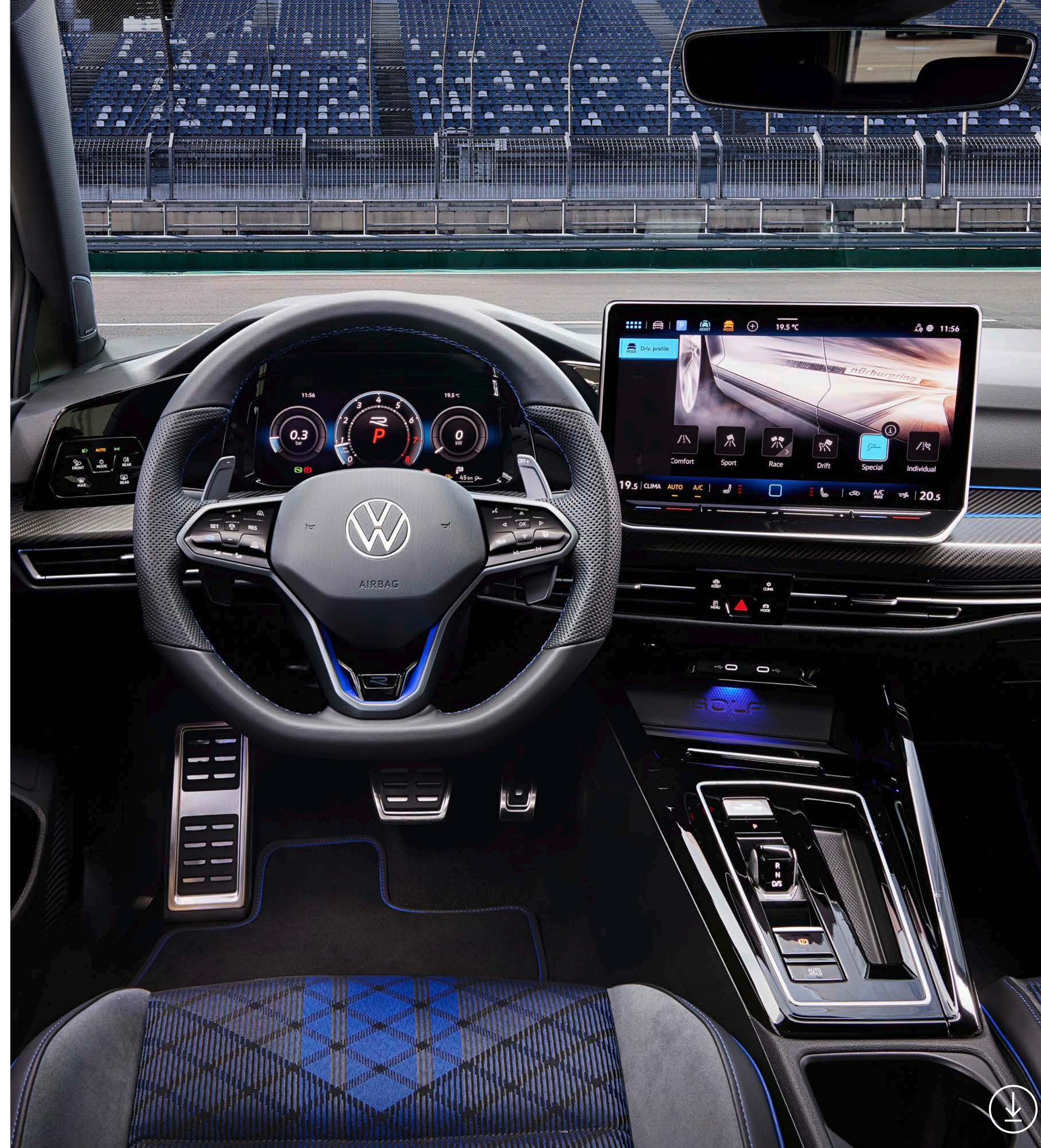
The Golf R with the Digital Cockpit Pro and new infotainment system display.

Extended Digital Cockpit Pro The new Golf R models are equipped with the enhanced Digital Cockpit Pro as standard (display diagonal: 26 cm/10.2 inches). The driver can use corresponding buttons on the multi-function steering wheel to set up different basic graphic configurations (information profiles): in addition to the classic views from other models in the product line, the Digital Cockpit Pro in the Golf R offers an enhanced Sport skin, featuring a central round rev counter with an R-specific design including the R logo. A three-dimensional layout – the R view – with numeric fields is additionally available. As an exclusive feature, there is a horizontal rev counter at the top edge of the display. The scale for this flat, horizontal display ranges from 0 to 8 (equivalent to 0 to 8,000 rpm). In models with the Performance package, the display provides gear-shift recommendations when manual DSG