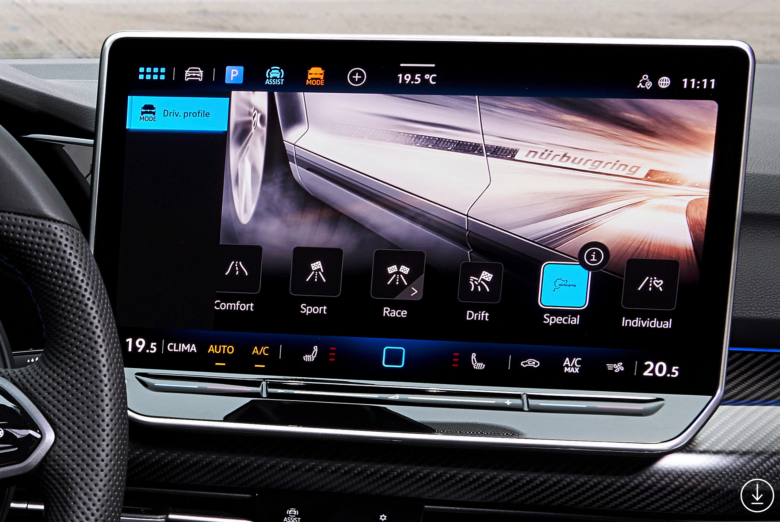
The Special driving profile is designed for the Nürburgring Nordschleife.

Special profile The Special profile has been specifically configured for the Nürburgring Nordschleife and configures a softer setup for the DCC running gear compared with Race mode, to make sure the Golf R can maintain maximum contact with the road on the undulating Nordschleife track. The adaptive chassis control DCC is configured