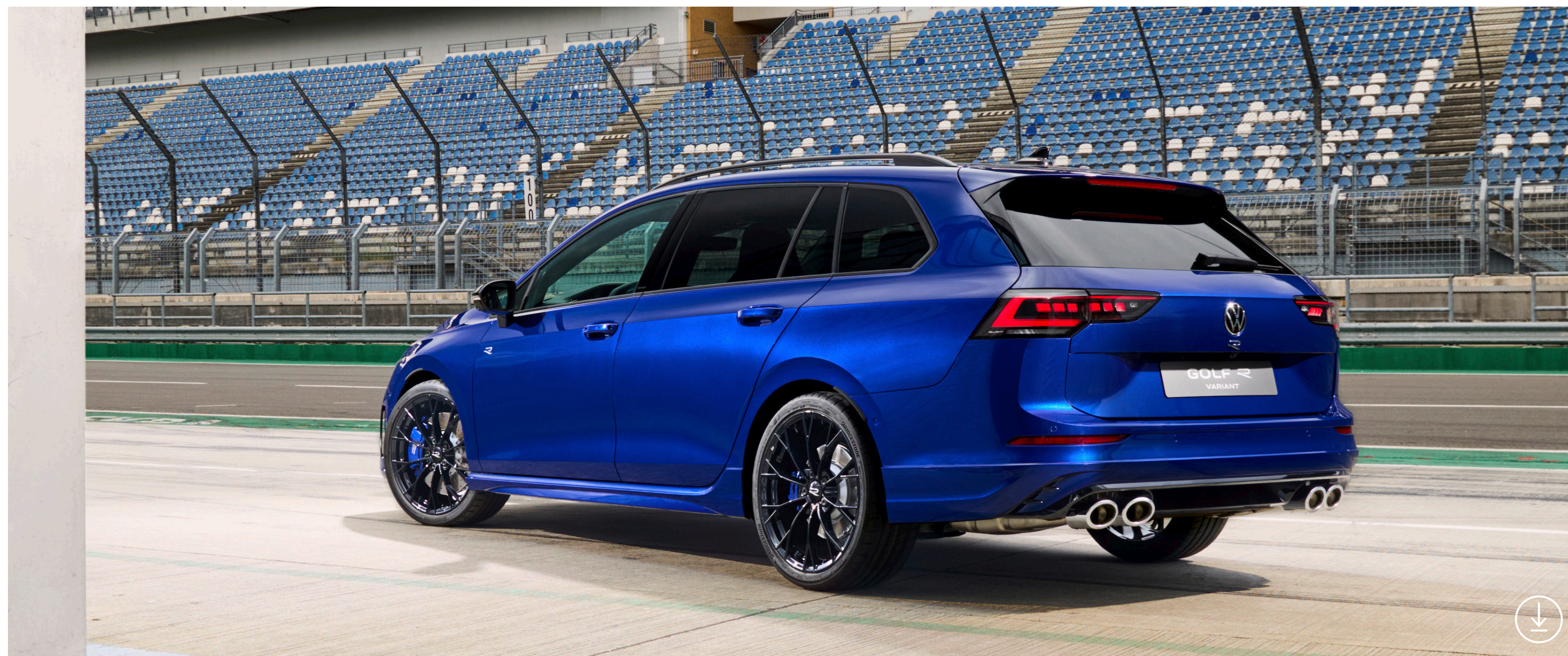
The Golf R Variant is offered for the first time with an output of 245 kW (333 PS).

power. The times for the classic sprint from 0 to 100 km/h have thus now been shortened to 4.6 and 4.8 seconds (Variant) respectively. In the latest generation too, the top speed can be increased by 20 km/h to 270 km/h 2 by adding the Performance package 4 . This makes the Golf R models the world's fastest Volkswagens together with the Arteon R Shooting Brake 6 .