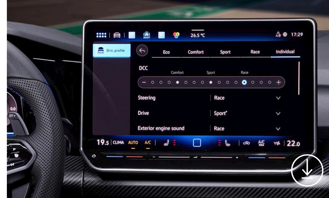
The DCC running gear can be adjusted individually.