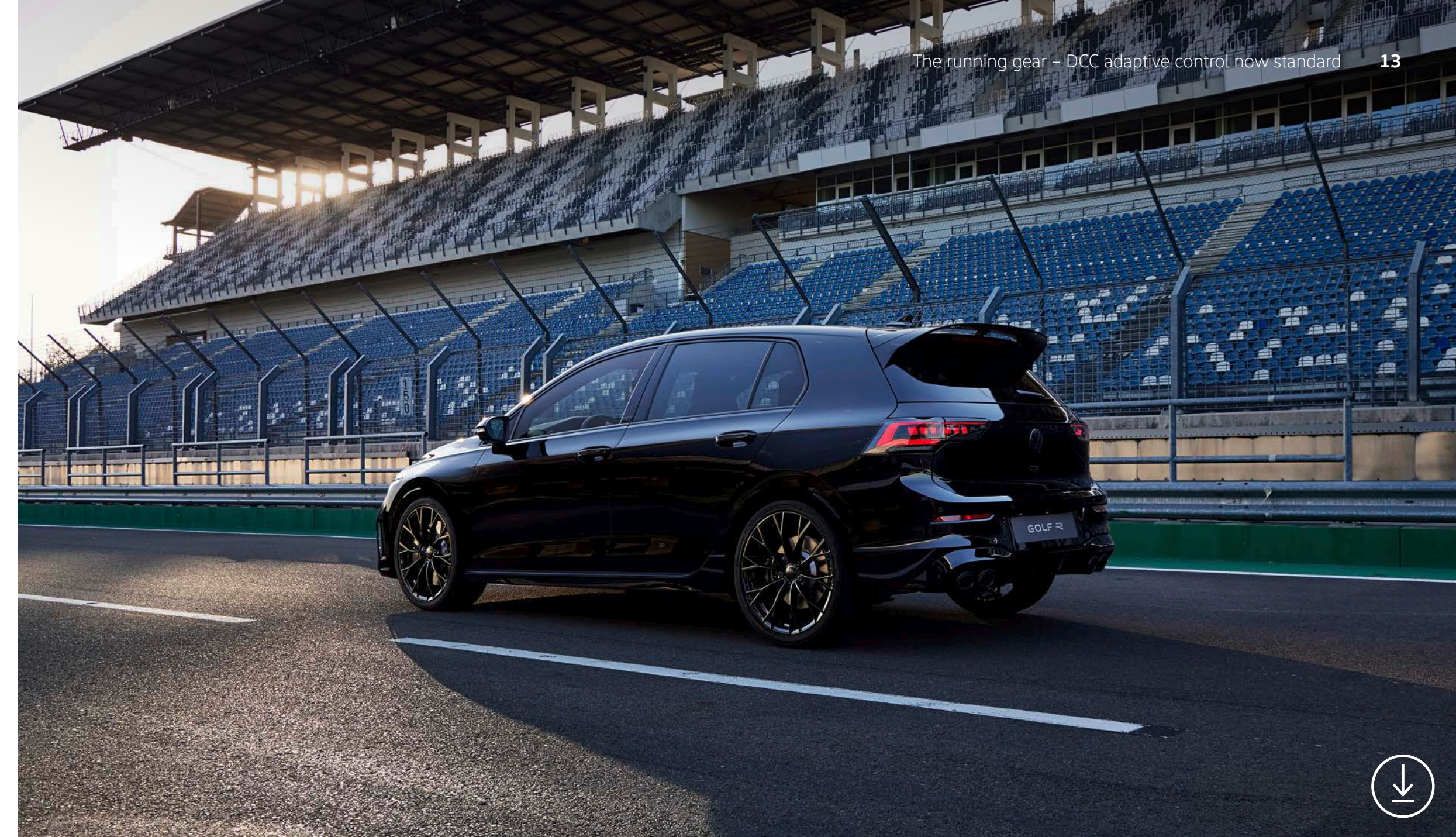
The exclusive Golf R Black Edition.

DCC adaptive chassis control The DCC adaptive chassis control – which in Germany is now fitted as standard in the Golf R and Golf R Variant – continuously reacts to the