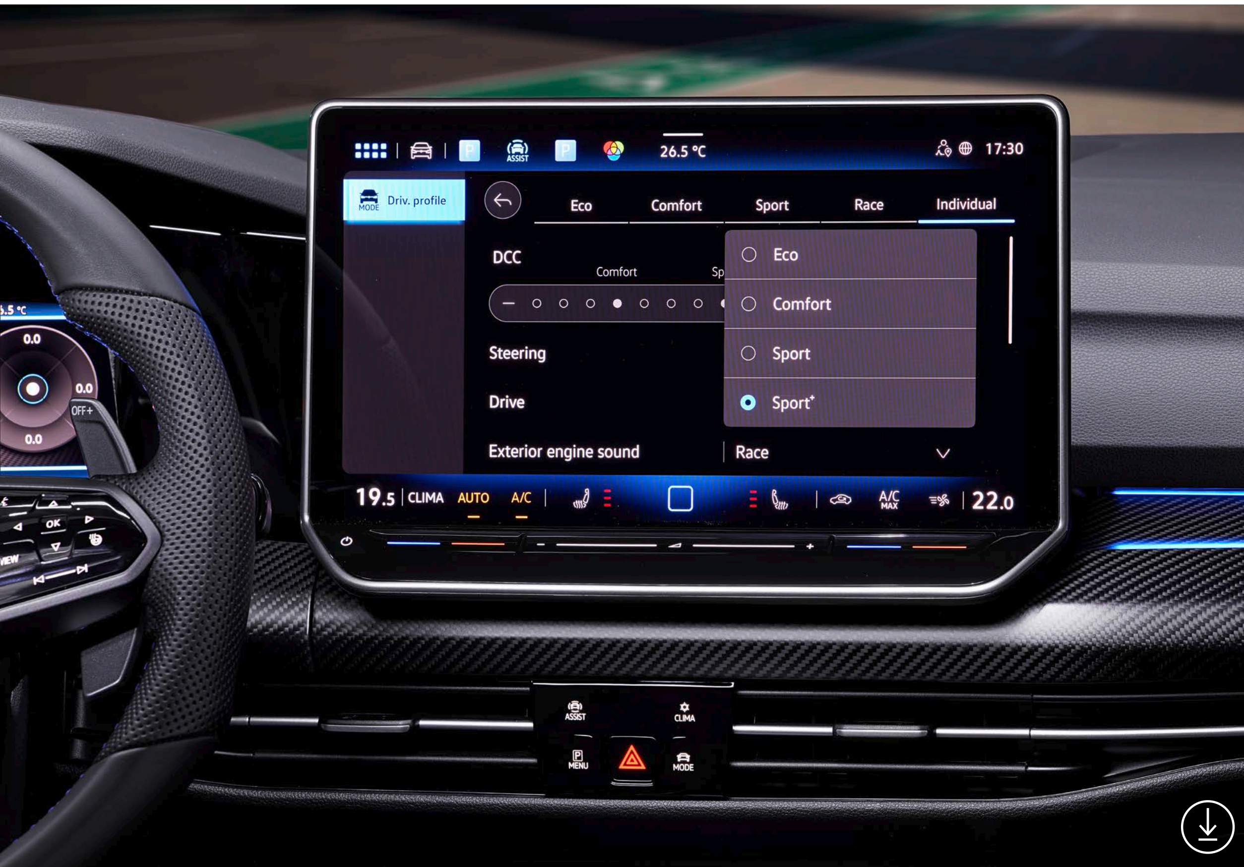
The driving profile selection in the new infotainment system display.