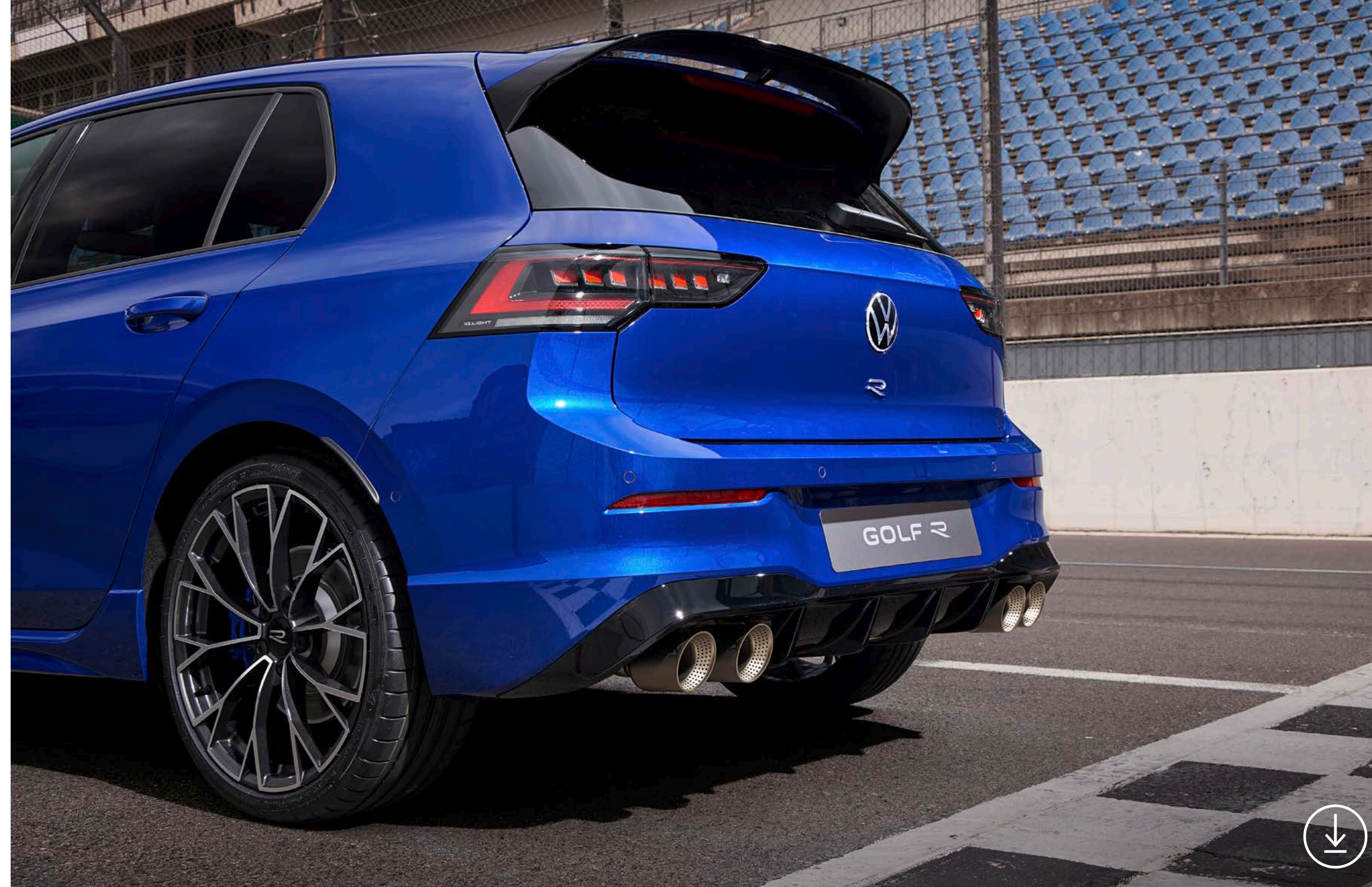
The Golf R with the new 19-inch Warmenau forged wheel.

New developments are the already mentioned 19-inch Warmenau 4 forged wheels (named after the headquarters of Volkswagen R in the town of Warmenau on the outskirts of Wolfsburg). With a weight of only eight kilograms per wheel rim, they are about 20 per cent lighter than comparable alloy wheels – this reduces the unsprung masses and ensures perfect handling. In addition, the very large opening degree of the rims (71 per cent) improves stability and wear resistance as the brakes are cooled even more effectively and are thus subjected to less thermal stress, especially on race tracks.