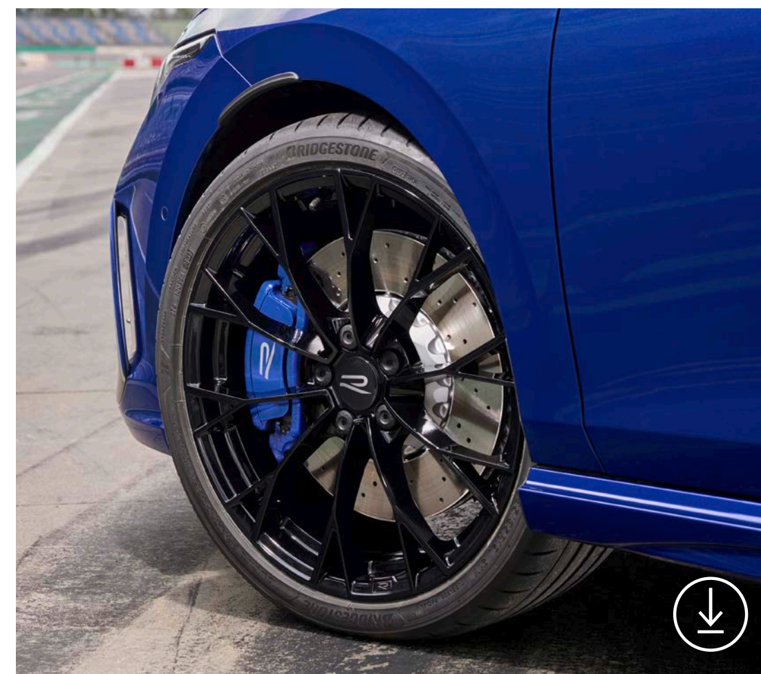
The Golf R with the 19-inch Estoril wheel.

The Golf R models (except Golf R Black Edition) are equipped with the 18-inch Jerez wheel rim and 225/40 tyres as standard. The 19-inch Estoril wheel rim 4 with diamond-cut surface (standard for Performance package) or in all-black trim (standard for Golf R Black Edition) with 235/35 tyres is available as optional equipment. As a completely new development, the new 19-inch Warmenau 4 forged wheel is optionally available for all models in Black or with a diamond-cut finish (also with 235/35 tyres). The 18-inch Bergamo winter wheel 3,4 in "Sterling Silver" with 225/40 tyres is also