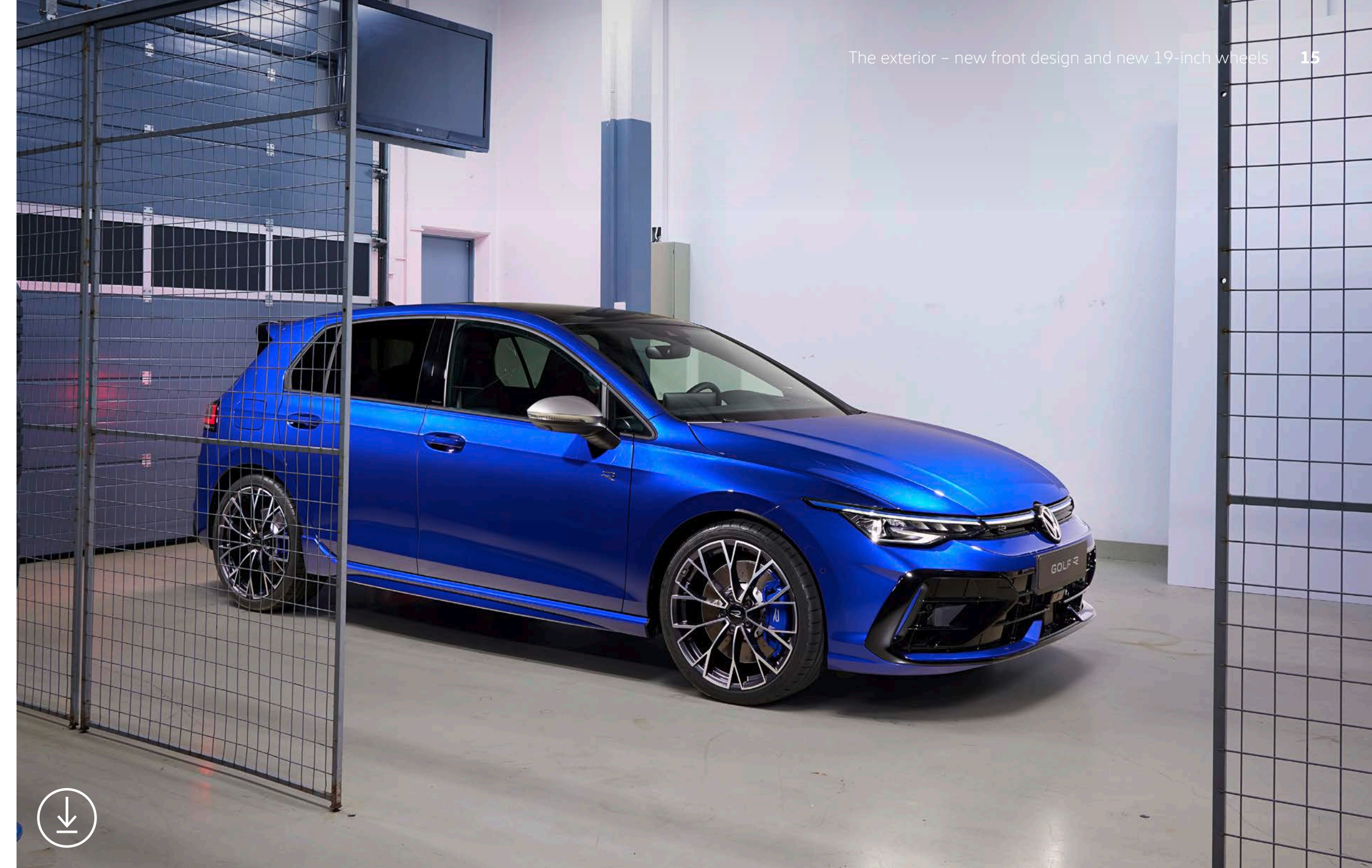
The front bumper and LED headlights have been redesigned.

Silhouette in R design At the sides, the new Golf R and the Golf R Variant are distinguished from all other models in the product line by the exterior mirror housings in matt chrome (with R logo projection as part of the exterior background lighting), the R logo on the doors below the exterior mirrors, side members with a specific design, silver-anodised roof rails on the Golf R Variant and an independent wheel rim range. For the first time, the hub caps on the 18- and 19 4 -inch wheels feature the R logo instead of the Volkswagen badge.