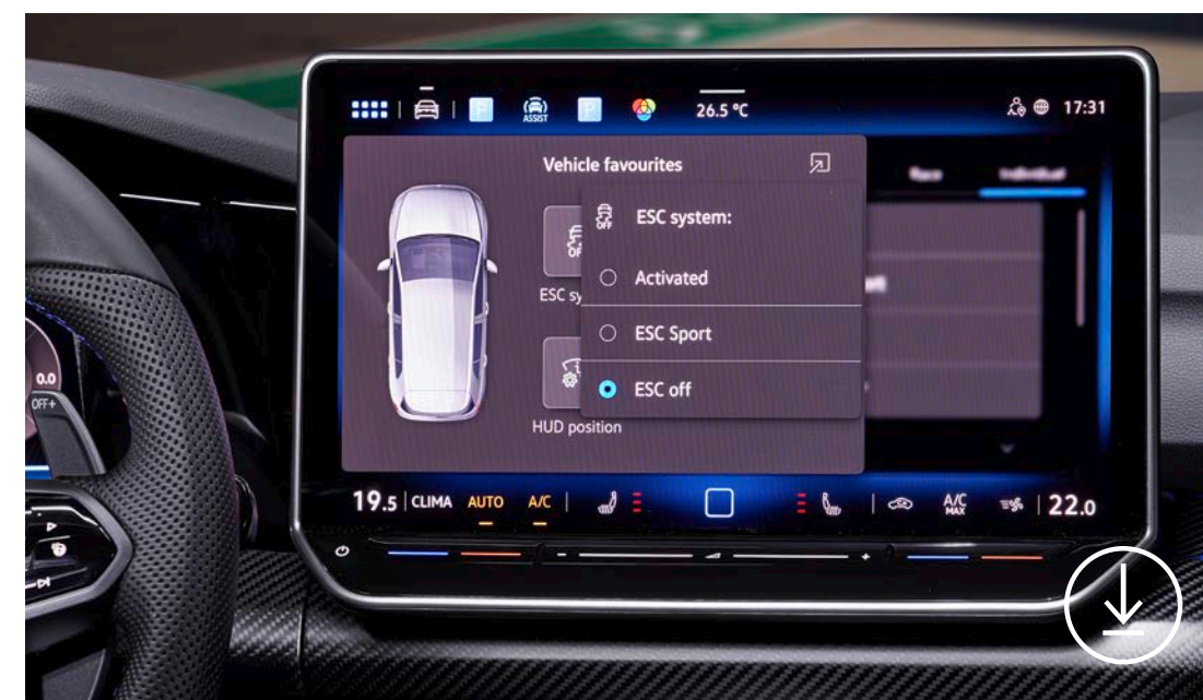
The driver can adjust the ESC to the respective situation.