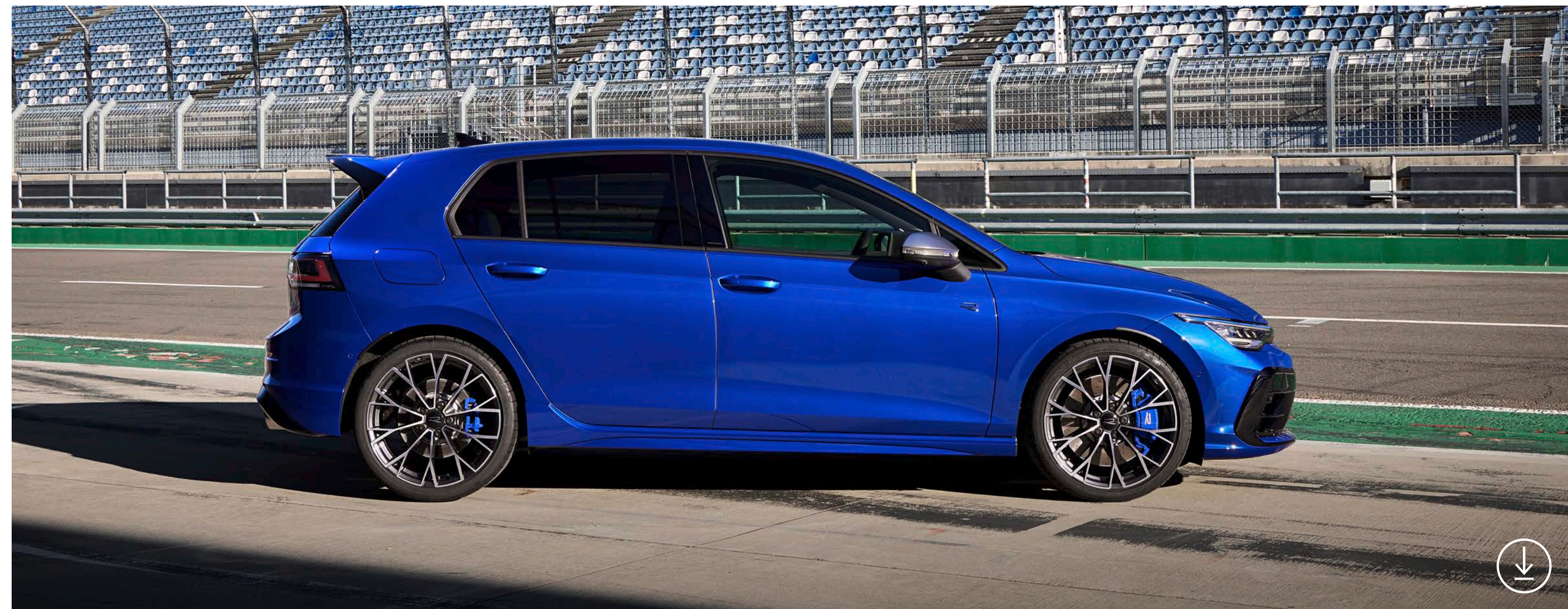
The Golf R with the optional 19-inch Warmenau forged wheels.

yaw rate and speed. The driver can use the driving profiles to influence operation of the stabilising vehicle dynamics systems and the 4MOTION all-wheel drive system with R-Performance torque vectoring.