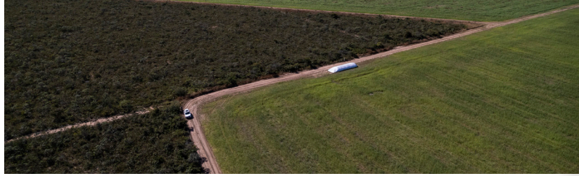
Image: Farmer Y property – Aerial view of crops planted to feed animals on factory farms.

Our second investigation with Repórter Brasil, uncovered JBS' links with 'grain laundering'. Some farmers adopt this illegal practice to profit from growing grain on prohibited land. It enables them to evade government bans designed to allow vegetation to regenerate following previous unauthorised land clearance.