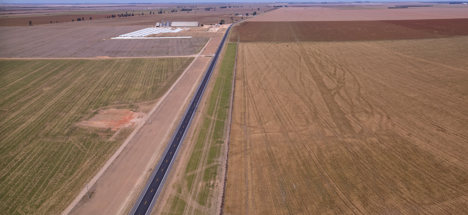
Image: Farmer X property – Crops are planted to feed animals on factory farms.

And the examination of the boundaries of the properties of farmer Y showed there was evidence of insufficient land authorised to grow grain to meet the terms of the contract. This suggests the grain must have come from elsewhere – most likely from prohibited areas – and this lack of contract specificity facilitates grain laundering.