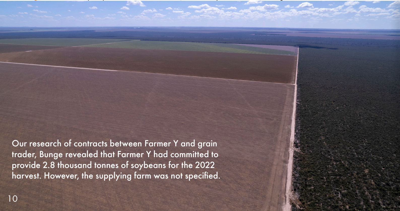
Image: Aerial view of soja crops. This land is under IBAMA (Brazil Ministry of Environment) embargo at Bahia State, Brazil.

Our research of contracts between Farmer Y and grain trader, Bunge revealed that Farmer Y had committed to provide 2.8 thousand tonnes of soybeans for the 2022 harvest. However, the supplying farm was not specified.