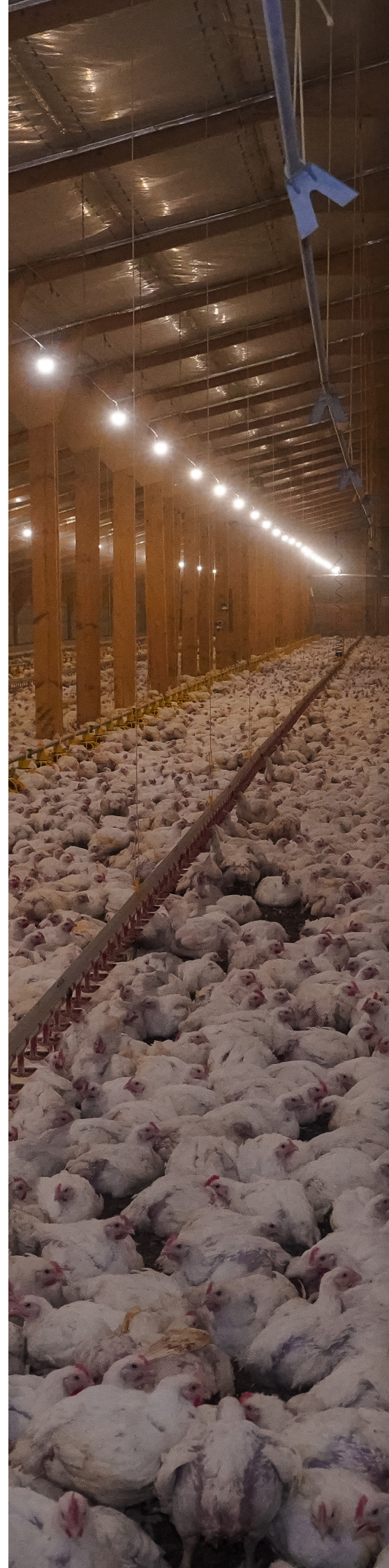
Image: A global trade in animal feed underwrites factory farmed meat production around the world. Pictured: UK farm.

World Animal Protection head of animals in farming campaign