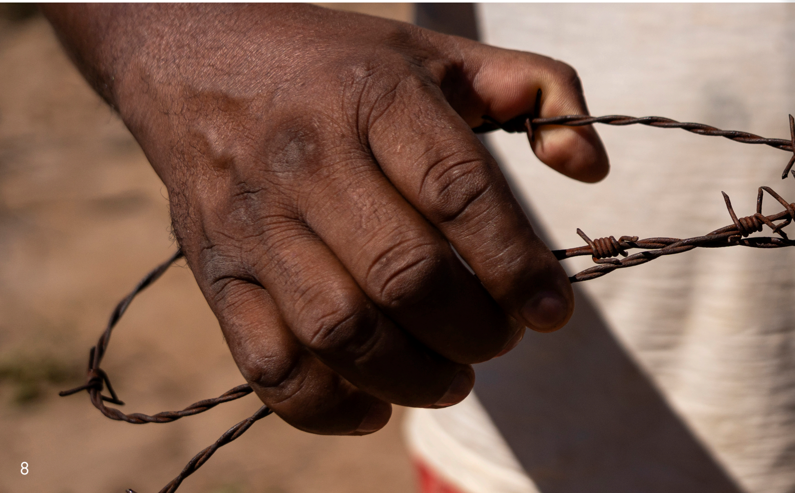
Image: A traditional small scale farmer finds his wire fence has been cut.

A new World Animal Protection investigation with Repórter Brasil, reveals JBS links with Farmer X who registered neighbouring traditional community land in the threatened Cerrado as his own. Farmer X is a powerful farmer who owns three farms in the region totaling 12,500 hectares.