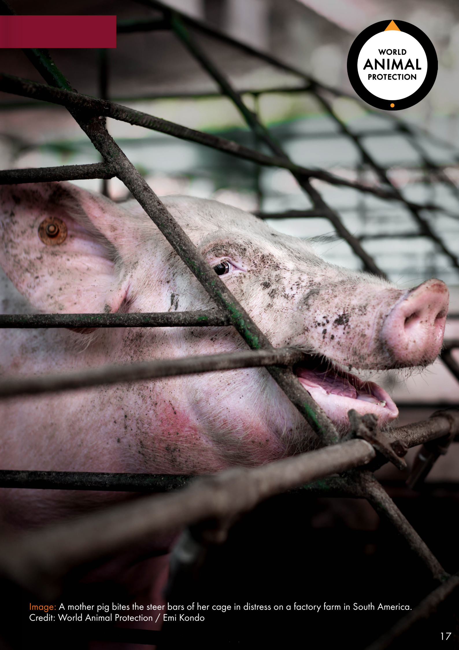
Image: A mother pig bites the steel bars of her cage in distress on a factory farm in South America.