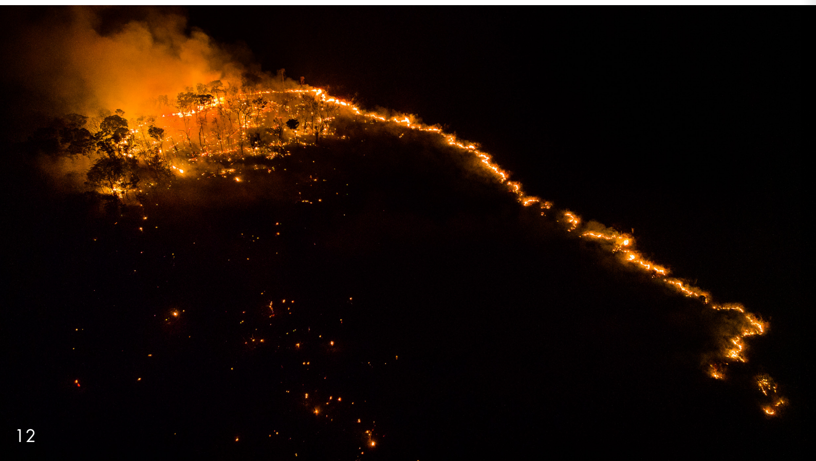
Image: Fire is used to clear land to grow animal feed crops, decimating wildlife habitat and exacerbating climate change. Fire in Nova Mutum municipality, Brasil.

And it’s not just JBS. All global factory farming giants must reduce the amount of meat they produce, and instead embrace humane and sustainable plant-based food. This is for the sake of people, animals and our climate crisis.