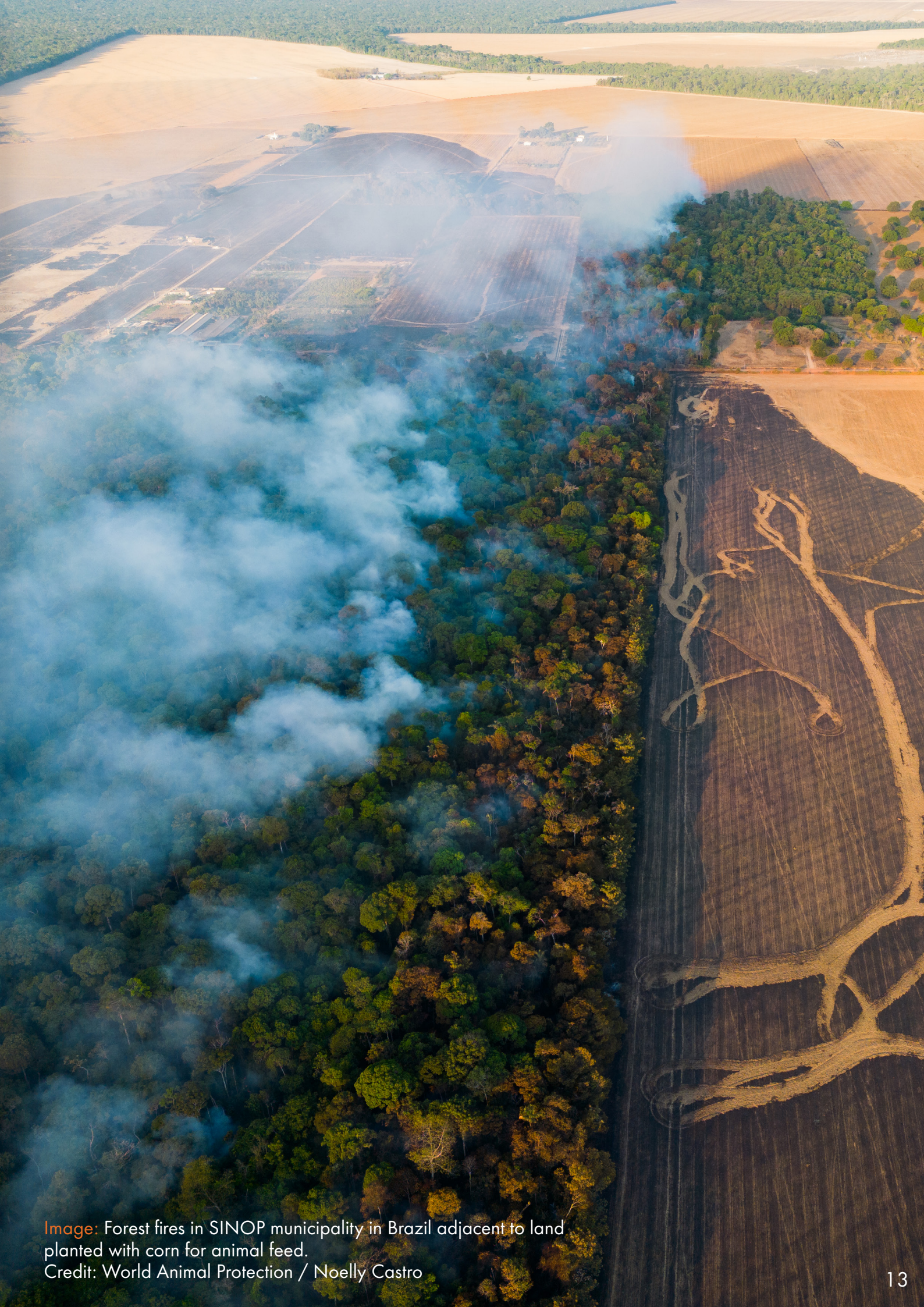
Image: Forest fires in SINOP municipality in Brazil adjacent to land planted with corn for animal feed.