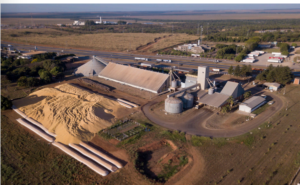
Images: Aerial view of corn silos at Tangará da Serra, Mato Grosso, Brazil

And the examination of the boundaries of the properties of farmer Y showed there was evidence of insufficient land authorised to grow grain to meet the terms of the contract. This suggests the grain must have come from elsewhere – most likely from prohibited areas – and this lack of contract specificity facilitates grain laundering.