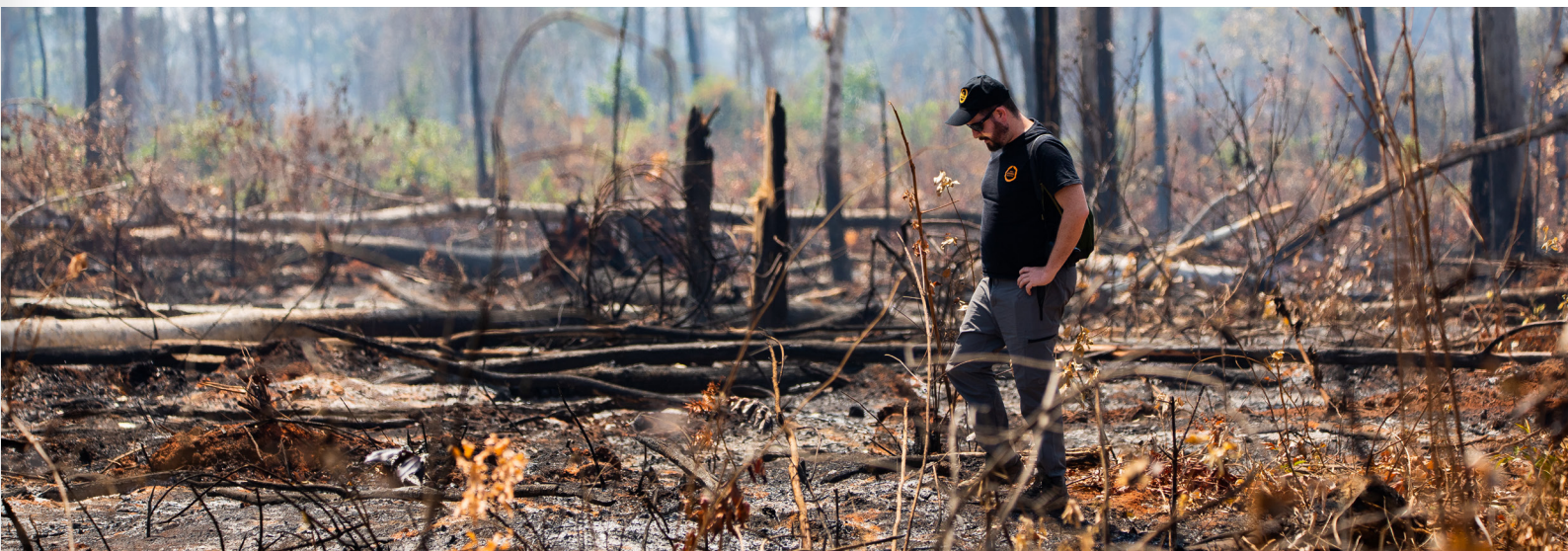
Image: World Animal Protection and local partner, GRAD, monitor the impact of fires on wildlife and help injured animals in Nova Ubirata municipality, Brazil.

And this is not only about Brazil. Factory farming continues to spread across our planet. Increased demand for meat and animal feed drives what happens on the frontlines of habitat destruction.